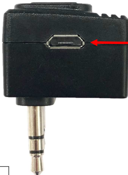
Micro USB Charging