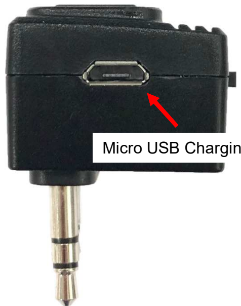
Micro USB Charging