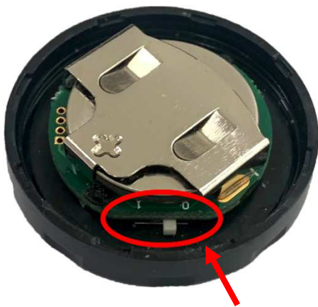
Slide the switch from 0 to 1