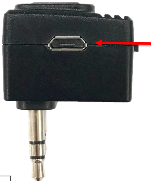
Micro USB Charging