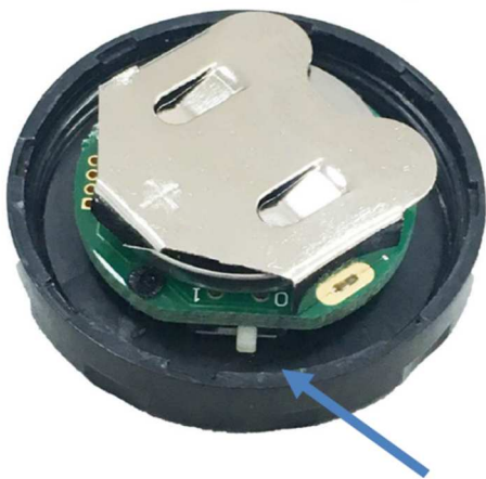
Slide the switch from 0 to 1