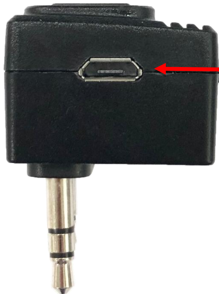
Micro USB Charging