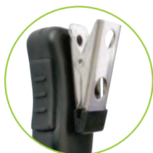
Metal Reinforced Swivel Clip