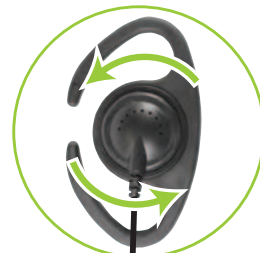
Patented D-Loop Design Rotates to Fit Either Left or Right Ear