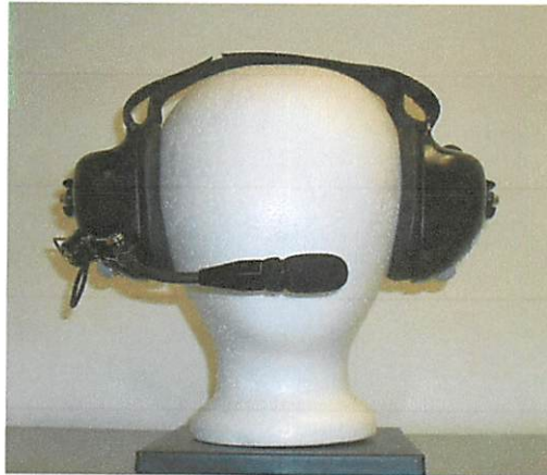
Test Item: Q3021A

These data were obtained through measurements made at the laboratories of Michael & Associates, Inc., State College, PA , USA. Michael & Associates, Inc., is accredited to test to ANSI S3.19-1974, ANSI S12.6-2008, ANSI S12.42-2010, EN352 parts 1-8 and AS/NZ S1270:2002 by the National Institute of Standards and Technology (NIST) National Voluntary Laboratory Accreditation Program (NVLAP).